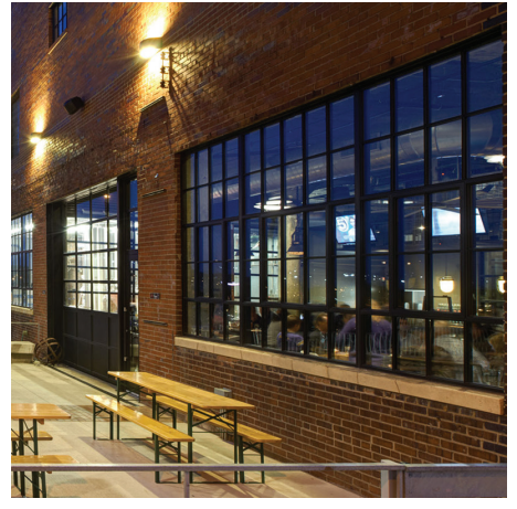
These easily applied muntins will enhance the design of any project.